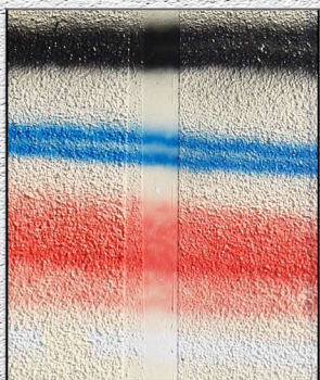
Spray paint graffiti applied to surface with GRAFFITI GARD® IV Low Luster.

TEX-COTE® SACRIFICIAL GRAFFITI GARD® is a specially formulated and blended water-based resin for optimum performance as a protective sacrificial system over new or previously painted substrates. Sacrificial GRAFFITI GARD® may be removed with a hot water blaster with water temperature of 170° F - 180° F.