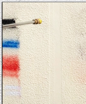
Graffiti removal using power washer.