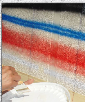
GRAFFITI GARD® Biodegradable stripper applied one week after graffiti application.