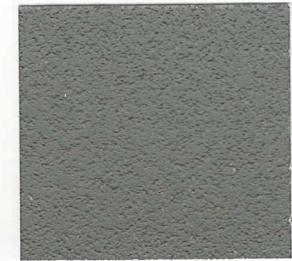
CINDER GREY T-213