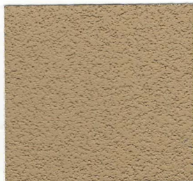
CAMEL BACK T-210