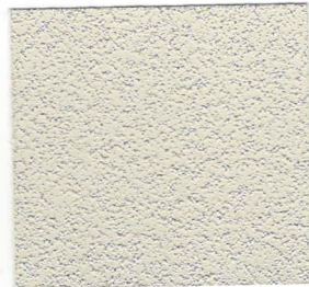
IVORY CHALK T-202