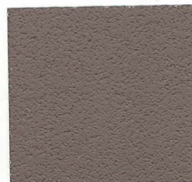
DEEP EARTH T-215