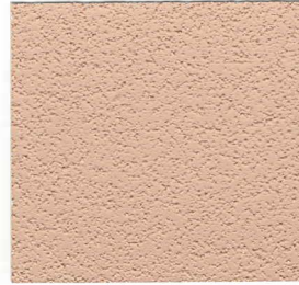
MEXICAN TILE T-204