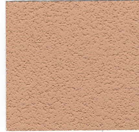
ITALIAN EARTH T-208