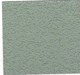
PALE MOSS GREEN T-203