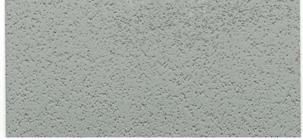
FROST GREY T-201