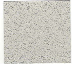
SEQUOIA DUSK T-205