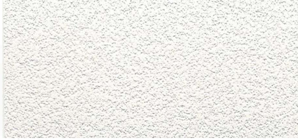
COOL WHITE T-200