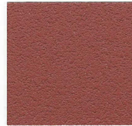
SANTA FE T-216