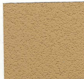
GOLD TORCH T-214