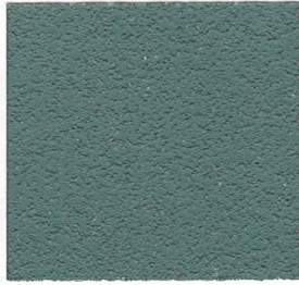
SPRING TURF T-207