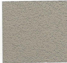
PUTTY BEIGE T-206