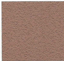
COCOA BEAN T-211