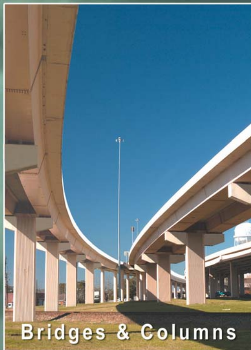
Bridges & Columns