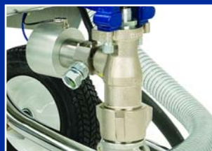
High-output piston pump.