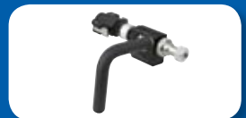
FreeFlo Inline Gun