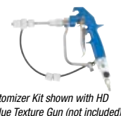
Atomizer Kit shown with HD Blue Texture Gun (not included)

*Nozzle size requirement could vary based on material viscosity, desired finish, production rate and air settings