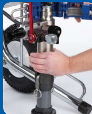
Tool-less ProConnect™ Pump System allows you to change pumps in seconds