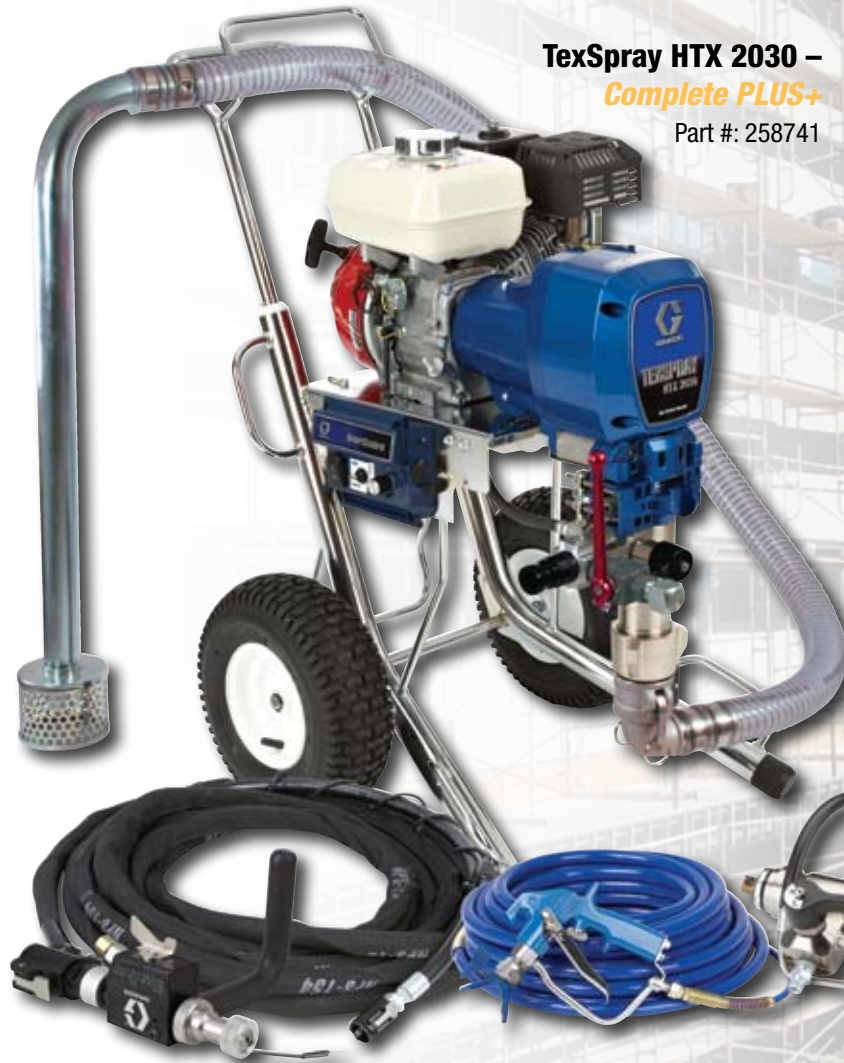
TexSpray HTX 2030 – Complete PLUS+ Part #: 258741