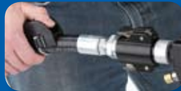
Remote on/off switch electronically engages pump, eliminating the need for a gun valve

materials, it can also spray drywall mud in an orange peel, splatter or knockdown finish. Combine this with the available MaxLife™ Endurance™ High Pressure Pump and you can spray a wide variety of interior and exterior smooth materials including primers and paints.