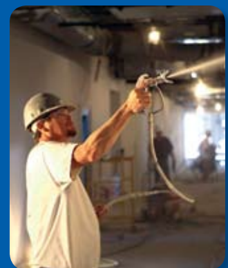
Expand your capabilities and spray a wide variety of materials