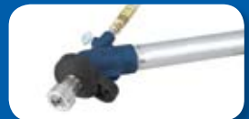
Pole Gun with Fine Finish Kit (included with Pole Gun Applicators; Patent Pending)