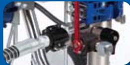
No-tools hose connections at pump and gun