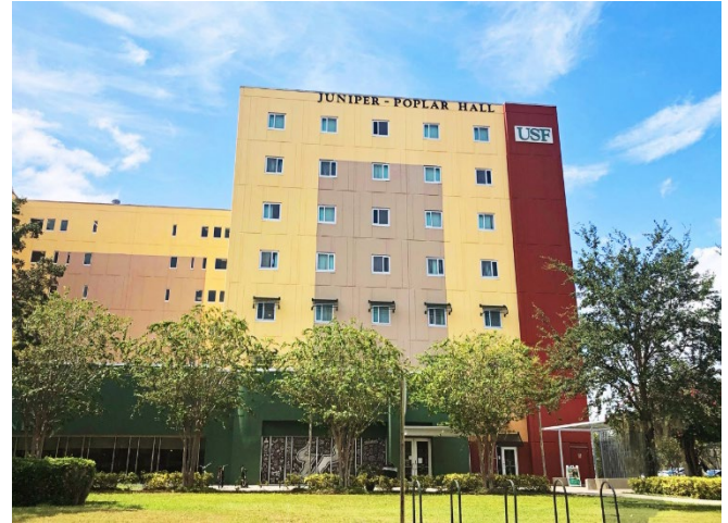
University of South Florida – Juniper Poplar Hall