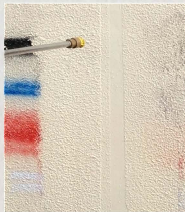
Graffiti removal using power washer.