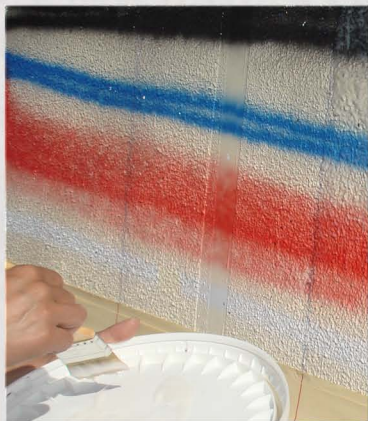
GRAFFITI GARD® Biodegradable stripper applied one week after graffiti application.